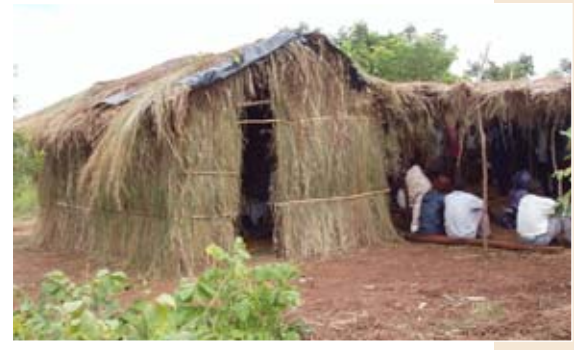
We met with the newly established Mphandula church

work with us have suffered. Several of the preachers and their families have contacted malaria. We are thankful to God that all have recovered. The rainy season is the worst time of the year for malaria, although it does occur year round. Malaria is the number one killer here. We practice